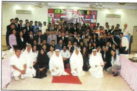
Group photo of the audience

There were three resolutions that were discussed during the proceedings – Comprehensive Test Ban Treaty, resolution for policies to govern and regulate currency